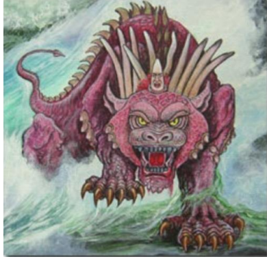
Beast Out Of The Sea

Revelation 13:1 And I stood upon the sand of the sea, and saw a beast rise up out of the sea, having seven heads and ten horns, and upon his horns ten crowns, and upon his heads the name of blasphemy. Revelation 13:2 And the beast which I saw was like unto a leopard, and his feet were as the feet of a bear, and his mouth as the mouth of a lion: and the dragon gave him his power, and his seat, and great authority. Revelation 13:3 And I saw one of his heads as it were wounded to death; and his deadly wound was healed: and all the world wondered after the beast. Revelation 13:4 And they worshipped the dragon which gave power unto the beast: and they worshipped the beast, saying, Who is like unto the beast? Who is able to make war with him? Revelation 13:5 And there was given unto him a mouth speaking great things and blasphemies; and power was given unto him to continue forty and two months. Revelation 13:6 And he opened his mouth in blasphemy against God, to blaspheme his name, and his tabernacle, and them that dwell in heaven. Revelation 13:7 And it was given unto him to make war with the saints, and to overcome them: and power was given him over all kindreds, and tongues, and nations.