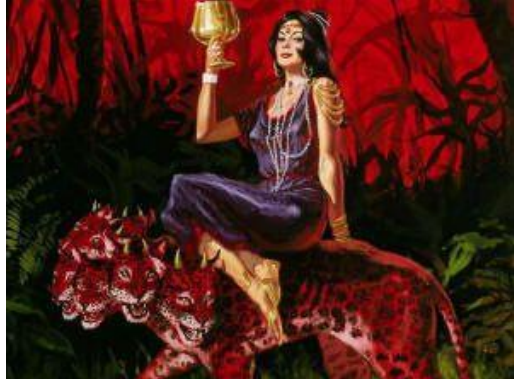
Scarlet Colored Beast

Revelation 13:1 And I stood upon the sand of the sea, and saw a beast rise up out of the sea, having seven heads and ten horns, and upon his horns ten crowns, and upon his heads the name of blasphemy. Revelation 13:2 And the beast which I saw was like unto a leopard, and his feet were as the feet of a bear, and his mouth as the mouth of a lion: and the dragon gave him his power, and his seat, and great authority. Revelation 13:3 And I saw one of his heads as it were wounded to death; and his deadly wound was healed: and all the world wondered after the beast. Revelation 13:4 And they worshipped the dragon which gave power unto the beast: and they worshipped the beast, saying, Who is like unto the beast? Who is able to make war with him? Revelation 13:5 And there was given unto him a mouth speaking great things and blasphemies; and power was given unto him to continue forty and two months. Revelation 13:6 And he opened his mouth in blasphemy against God, to blaspheme his name, and his tabernacle, and them that dwell in heaven. Revelation 13:7 And it was given unto him to make war with the saints, and to overcome them: and power was given him over all kindreds, and tongues, and nations.